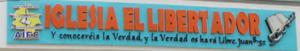
CIPEP Students in Puerto Libertador